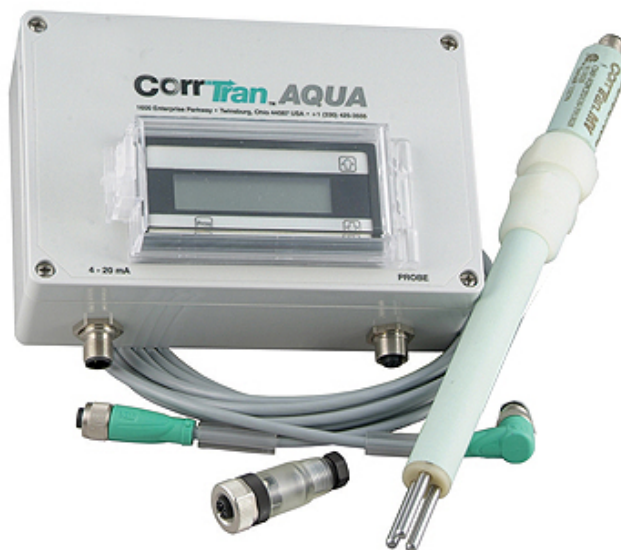
Probe shown in photo not included with transmitter

The CorrTran AQUA works with Metal Samples three-electrode CorrTran style probes and electrodes. Probes are available in a variety of mounting types and materials to suit almost any type of installation.