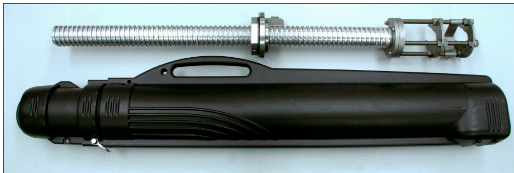
Easy Tool Retracting System & Case