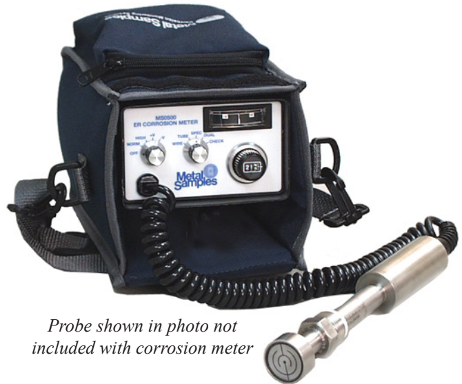
Probe shown in photo not included with corrosion meter

The MS0500 also offers a built-in battery test function, and comes in a convenient carrying case.