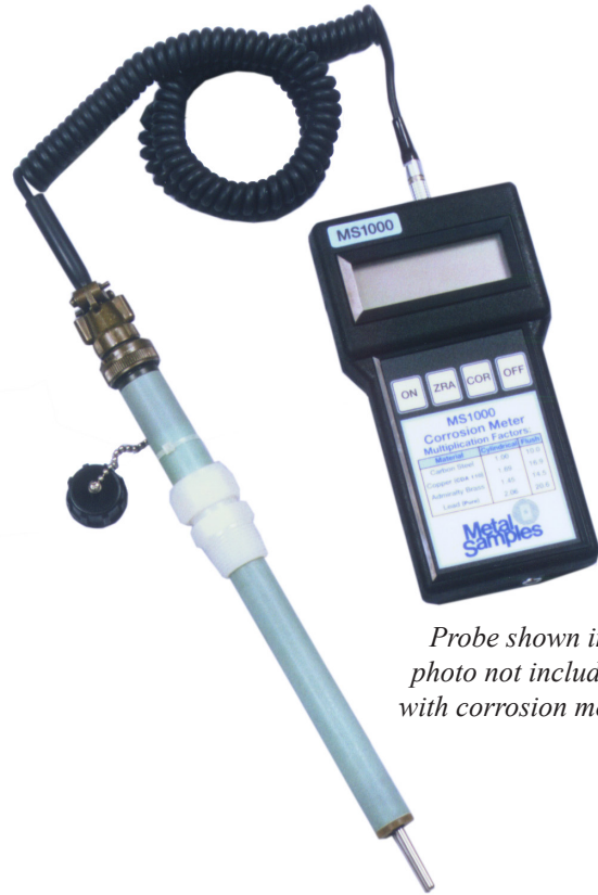
Probe shown in photo not included with corrosion meter

Corrosion rate measurements are made using the linear polarization resistance technique. The instrument measures the current required to polarize the electrodes of a probe to a known potential. From the polarization potential and the measured current, polarization resistance can be calculated. Then, using Faraday's law, instantaneous corrosion rate is calculated from polarization resistance.