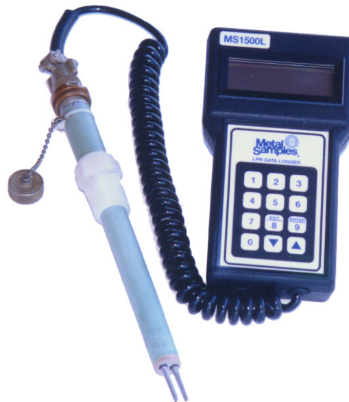
Probe shown in photo not included with corrosion meter

Corrosion rate measurements are made using the linear polarization resistance technique. The instrument measures the current required to polarize the electrodes of a probe to a known potential. From the polarization potential and the measured current, polarization resistance can be calculated. Then, using Faraday's law, the instantaneous corrosion rate can be calculated from polarization resistance.