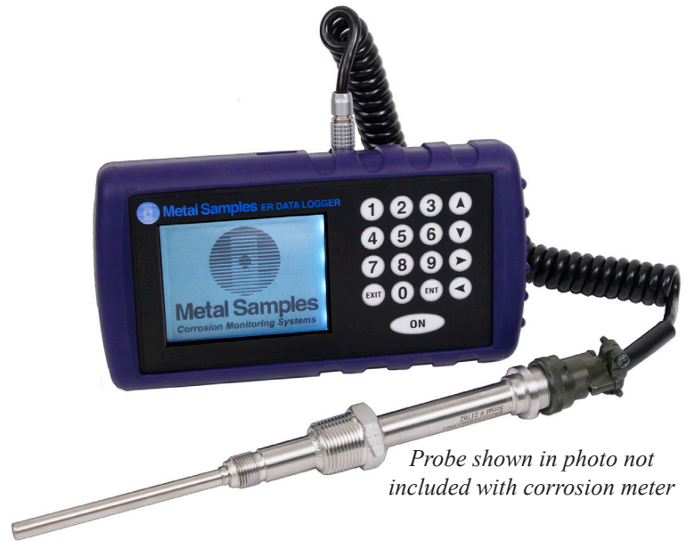
Probe shown in photo not included with corrosion meter

After taking a reading, the instrument displays metal loss in mils and corrosion rate in mils per year (mpy). The reading can then be stored to memory or discarded. All stored readings are automatically time and date stamped. Readings are stored to non-volatile Flash memory which retains data without the need for a battery backup.