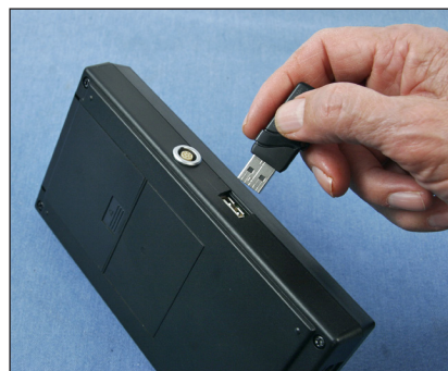
Transfer data directly to USB Flash drive

The MS4500E can store 16,000 readings per probe on up to 250 different probes (4 million total). Stored data can be downloaded directly to a USB Flash ("jump") drive in non-hazardous areas. Data can be opened and charted using the provided Corrosion Data Management software, or can be imported into any standard data analysis (spreadsheet) program such as Microsoft Excel. Data can also be reviewed and charted on the instrument's LCD display for quick reference.